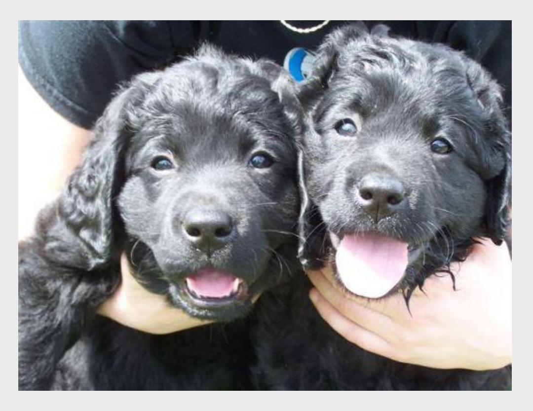
Long-haired Labrador retriever puppies.

Long-haired Labrador retrievers are a sort of atavism. The dogs look very much like the old wavy-coated retriever and the long-haired St. John's water dogs, which were essentially the same breed. They also point to the simple reality that Labrador, golden, and flat-coated retrievers are much more closely related than one might assume.